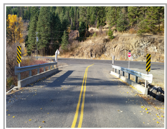
Liberty Road looking west to US 97